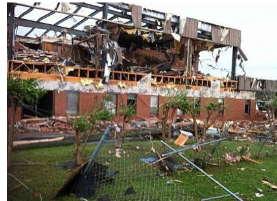
A TOTAL LOSS - The building of the Central Church of Christ in Tuscaloosa, Ala., sustained heavy damage during a tornado.

Moments before Wednesday's tornado obliterated the Central Church of Christ building in Tuscaloosa, Ala., six students huddled in a small cinderblock closet at the church.