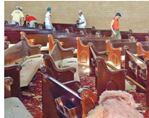
CENTRAL CHURCH OF CHRIST - Members survey tornado damage inside the Central Church of Christ auditorium. Some gather songbooks and begin removing pews.

coming in there... They’re all real red and scratched up. They didn’t (get) cut terribly bad. They didn’t get injured. One of them had a nail in his foot. That’s the worst of it.