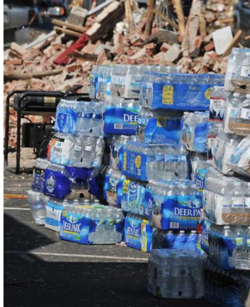
The Central Church of Christ in Tuscaloosa has already begun to be a staging area for disaster relief. This picture is from their website.

If you enjoyed reading our bulletin, please pass or forward it to others interested in the Cause of Christ