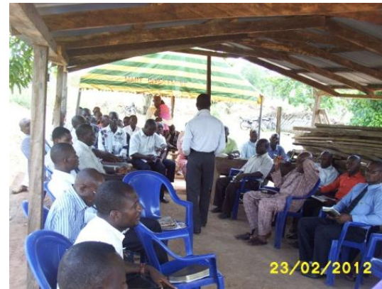
Marriage Seminar at Cross River State

Last week, 27th May I left to upper Cross River State to speak in the lectureship organized by the Church in Okpoma in