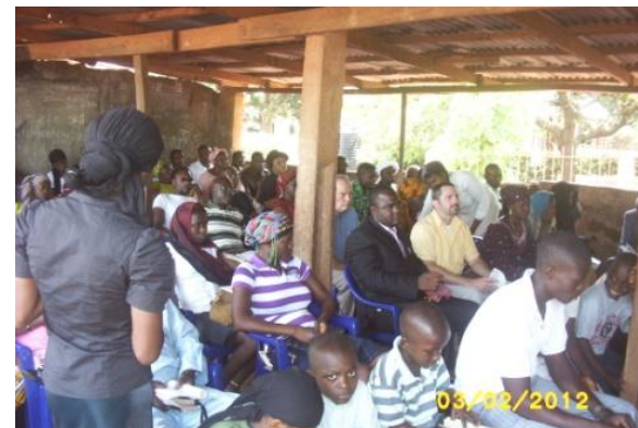
Otukpo Church of Christ

Brethren, whatever the case may be, it is never a waste to do good. The month of May was really a busy time for me. It started with the 9 day campaign in Otukpo, Benue