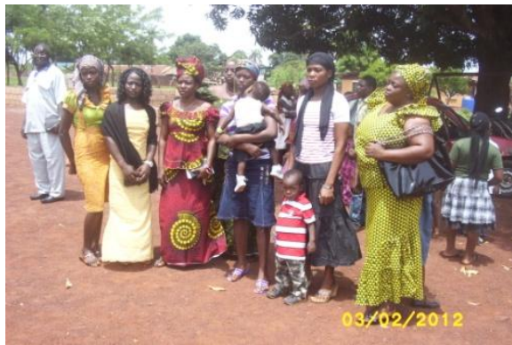
New Convert at Otykpo-Benue State