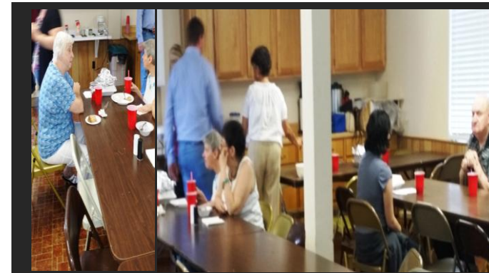
Last Week's Social