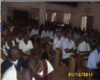
School children and the Kampala Church