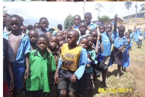
School children meeting us at Kasese