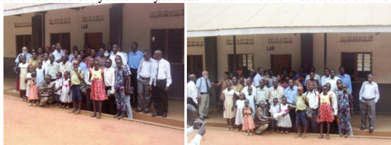
Kampala Church of Christ

Back in Nigeria, our work in Mazah, Toro, Foron and several other places are on going. I have not been able to reach Toro for some weeks now because of the Muslims who have made that road risky for people. They are calling me to come, but how to cross over to that side is a challenge. Please, pray with me for security. I am anxious meeting with these brethren. They too are worried as we never missed ourselves so long like this. Once again, thank you all for your kindness towards us. Thank you for supporting us. God has helped us so much in a way you may not imagine. May God continue to bless you all in your sacrifices. We are indebted to our Lord.