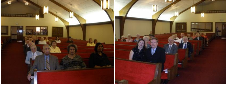
Raytown Church of Christ

If you enjoyed reading our bulletin, please pass or forward it to others interested in the Cause of Christ